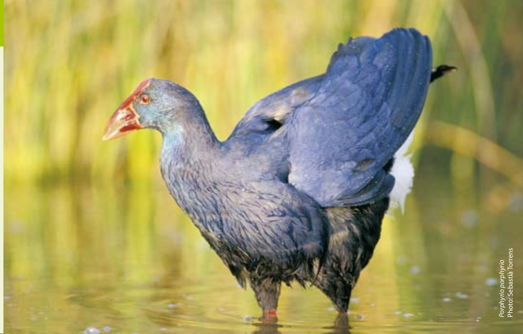
Porphyrio porphyrio

While part of the grassland area developed during the Tertiary Era, the current wetlands were formed less than 100,000 years ago. The coastal dunes are considerably more recent, forming over the last 10,000 years or so.