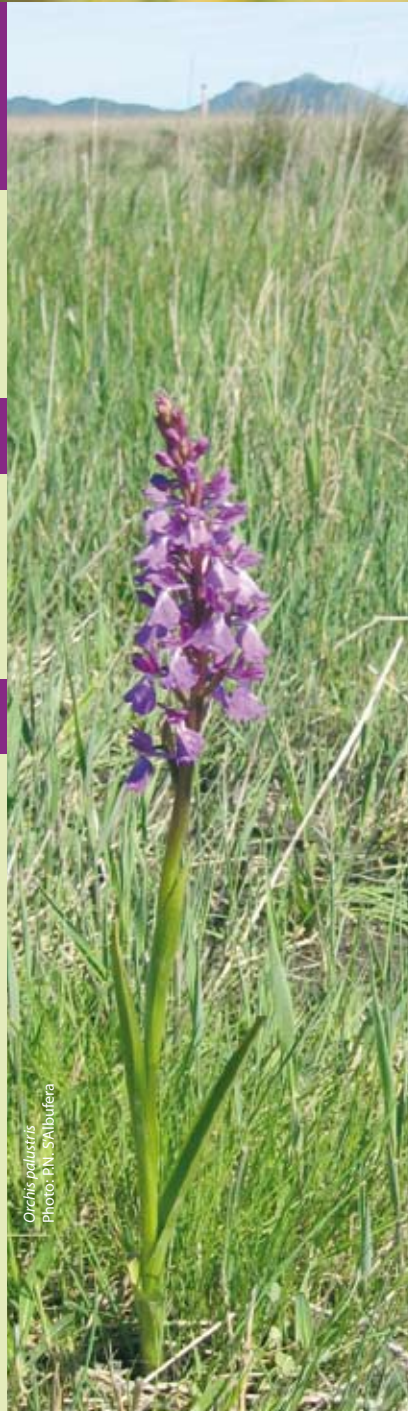
Orchis palustris